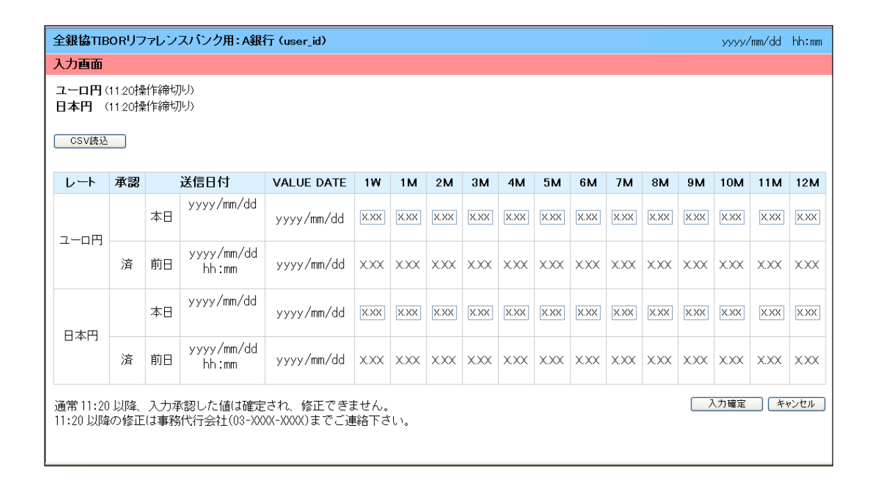
Table 2: List of JBA TIBOR Rates (Image)